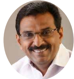
Anto Antony Member of the Lok Sabha

The attraction lies in educational and job opportunities rather than a collapse in the state's academic institutions